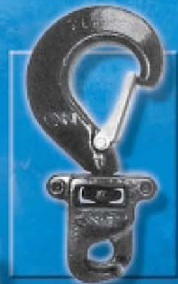
3303WLP Upper Shipyards Hook

Made in the USA for the ship building and metals fabrication industries.