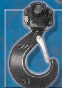
3403WLP Lower Shipyards Hook

For Construction and Industrial Applications • Capacities ¾, 1, 1½, 2, 3 Tons