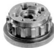
Optional Load Limiter