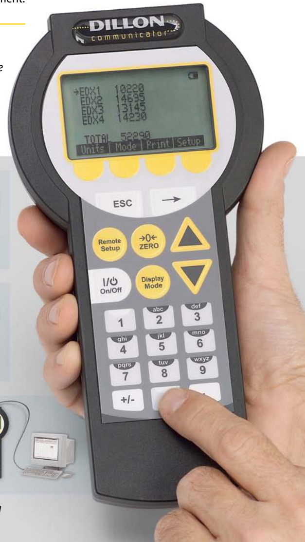
Optional Remote Communicator

A basic stand-alone model can be easily upgraded "in-the-field" to accommodate changing needs. Remote configuration, data acquisition and single point monitoring of multiple links are all possible with the hardwired or radio communication options available with the EDxtreme.