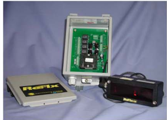
ReFlx 120 (reflector not shown)

The ReFlx 120 System features a two-channel infrared sensor, which can be adjusted to give separate outputs for each channel at distances from 20 to 120 feet. The most commonly wired configuration is the use of one channel to provide the primary stop command to the motion control, while the second channel is used as a redundant stop command.